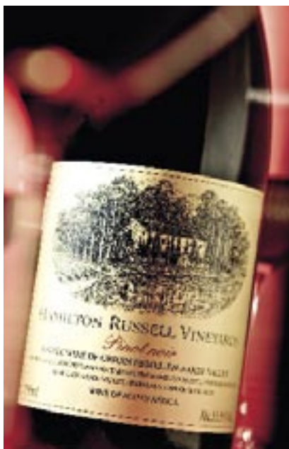
Above: the Cape has great potential for adding Pinot to its repertoire. Hamilton Russell is among the finest exponents

Only 175 barrels are made of this wine, so